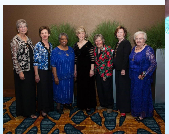
Below: Our Past International Presidents at the Banquet