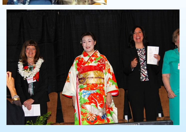
Wish you could have been here with us. We missed you!