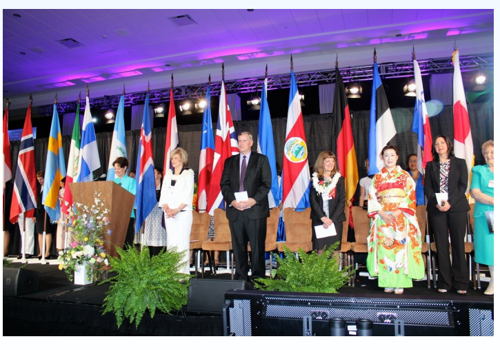
Below: Golden Gift 2014 Reunion-some of us Mississippi, Netherlands, Pennsylvania, Kentucky, South Dakota, Arizona, Hawaii, Texas